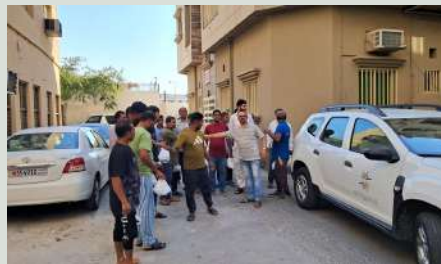
Food donated by the Sri Sathya Sai Global Council, in collaboration with MWPS, benefited 51 jobless and low-salaried individuals.